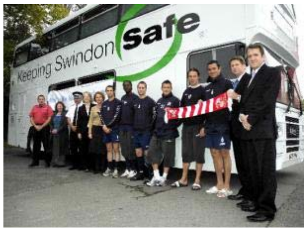
Community Safety Partnership members with the bus at the County Ground, which is being used in a campaign to cut anti-social behaviour

People will get the chance to climb aboard the bus and meet key staff from the different agencies that make up Swindon's Community Safety Partnership, including Wiltshire Fire and Rescue Service, Wiltshire Police, Wiltshire Probation Area, Swindon Primary Care Trust and Swindon Borough Council.